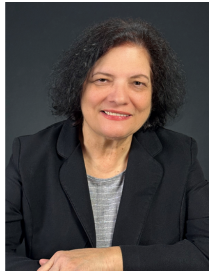
Michele Artale High School