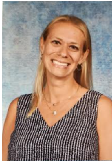
Stacie Noxon Middle School