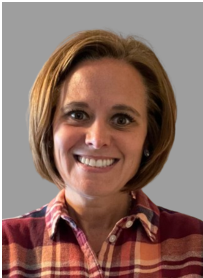
Sherry Heck Mill Pond