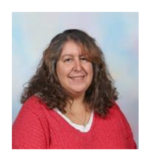
Doreen O'Sullivan High School