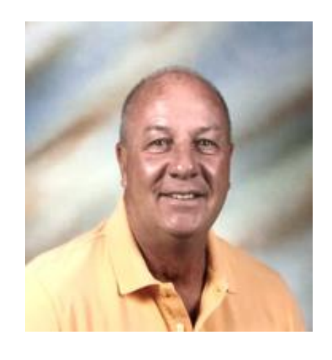
Charles Rieder Middle School